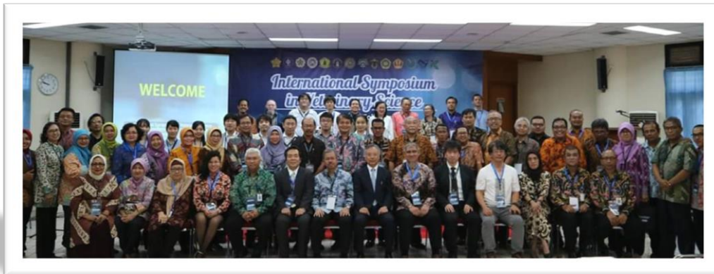
Figure 1. The 1 st AJIVE symposium in IPB University in 2017

Recently, there are many threats in the veterinary fields, such as the shortage of animal protein due to population growth, and an increase in trans-boundary/zoonotic diseases in Asia. Therefore, to face these significant threats, we should develop our veterinary education, research, and technology.