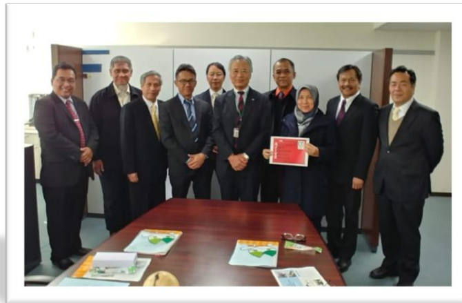
Figure 2. Inauguration of AJIVE in Japan, 2018

Since its founding, AJIVE has held the international symposium every year, hosted by the respective Faculty of Veterinary Medicine in Indonesia. Previously, the 1 st symposium (2017) in IPB University, Bogor; the 2 nd symposium (2018) in Gadjah Mada University, Yogyakarta; the 3 rd symposium (2019) in Airlangga University, Surabaya and the 4 th (2020) in Udayana University.